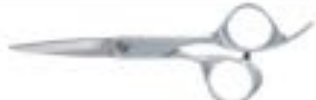
Transform Shears 5.25" Shear, 5.75" Shear