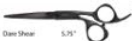
Dora Shear 5.75"