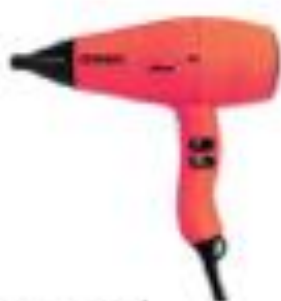
the mastermind valera x amika dryer