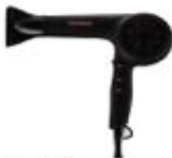
the immortal power-life dryer