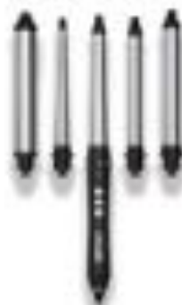
the chameleon 5 barrel interchangeable curling kit