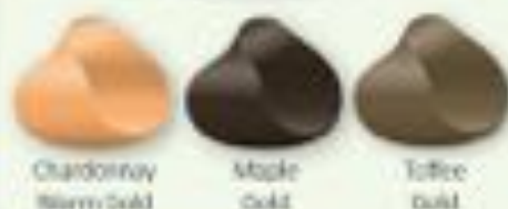
Chardonnay Warm Gold Maple Gold Toffee Gold