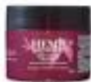
DEEP REPAIR MASQUE 8 OZ. code: 2026