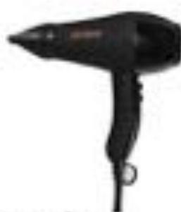
the accomplice compact dryer