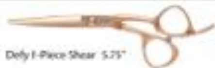
Dolly I-Piece Shear 5.75"