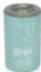
Surface Push Styling Powder .35oz