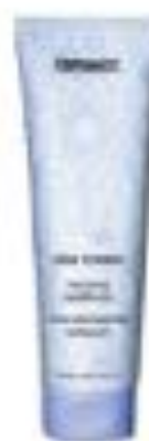
amika Nice Cream Cleansing Conditioner 8.45oz