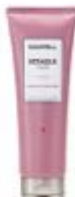
Kerastase Color Cleansing Conditioner 8.4oz