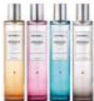
Kerasilk Hair Perfumes 1.7 oz