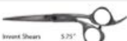
Invent Shears 5.75"