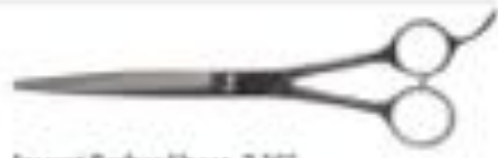
Invent Barber Shear 7.25"