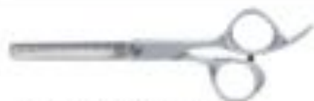
Transform Thinner 28-Tooth Thinner 5.75"