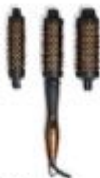
blowout babe interchangeable thermal brush