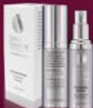
Size: 1oz./30ml, airless bottle