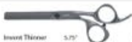
Invent Thinner 28-Tooth Thinner 5.75"