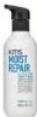
Kits Moist Repair Cleansing Conditioner 8.5oz