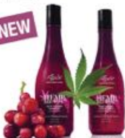
MOISTURIZING SHAMPOO 14.5 OZ. code: 10506