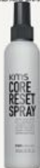
Core Reset 200ml