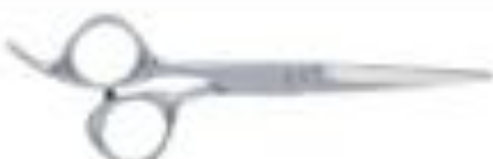
Transform Left-Handed Shear 5.75"