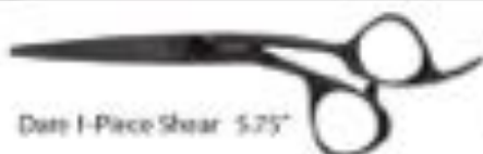
Dora I-Piece Shear 5.75"